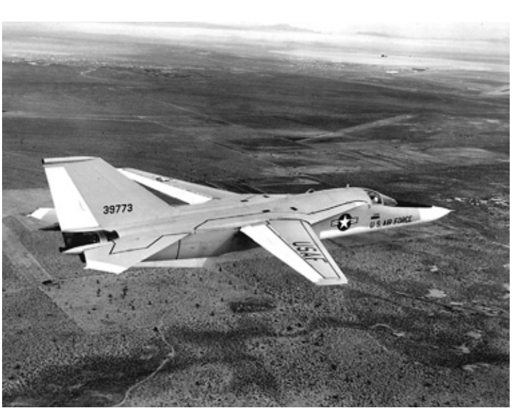
An F-111A with wings forward for lower-speed flight.